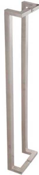
Wood or Metal Door Mount